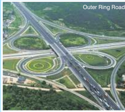
Outer Ring Road