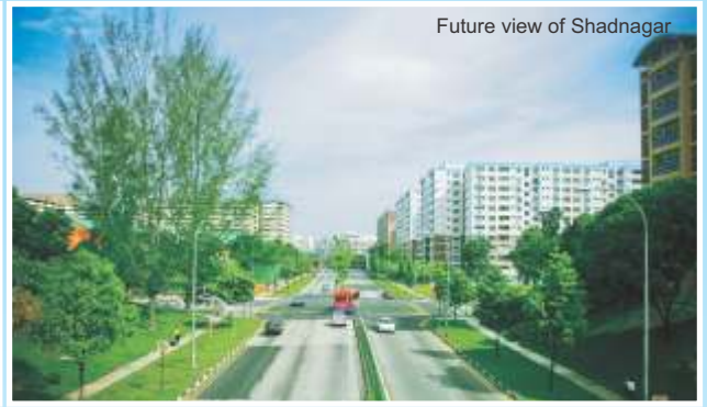
Future view of Shadnagar